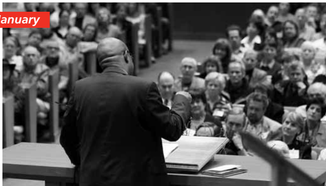
TFN partners with the James A. Baker III Institute for Public Policy to present a one-day symposium on "Religion in the 2012 Elections" in Houston (Pictured: Pulitzer Prize winner Leonard Pitts)