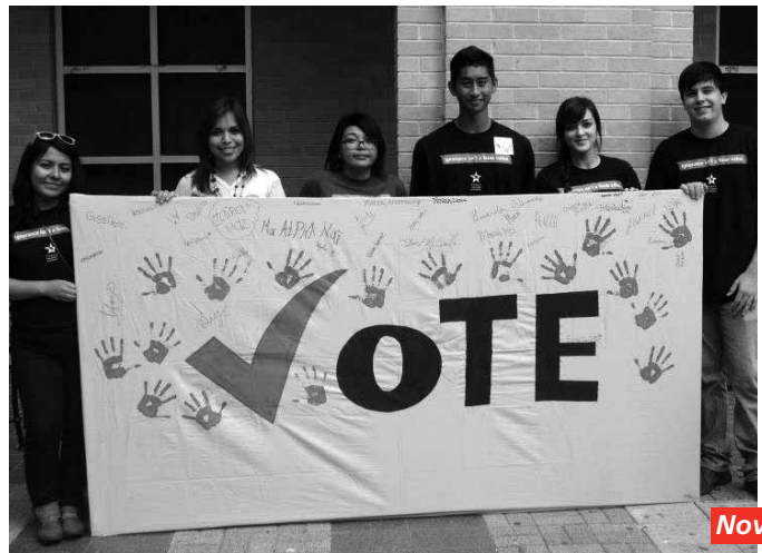
TFN activists help Get Out the Vote for State Board of Education elections across the state