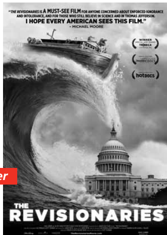
Award-winning documentary film "The Revisionaries" – starring TFN! – premieres in Dallas, Houston and Austin