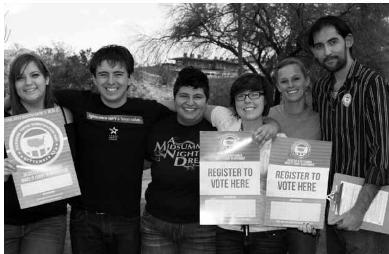
left picture: University of Texas-Pan American students take TFN's pledge to vote