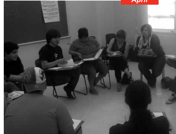
TFN student chapters host civic engagement trainings in Brownsville, Austin and El Paso