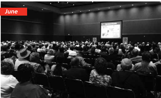
TFN packs the house for its workshop at the Texas State Democratic Convention